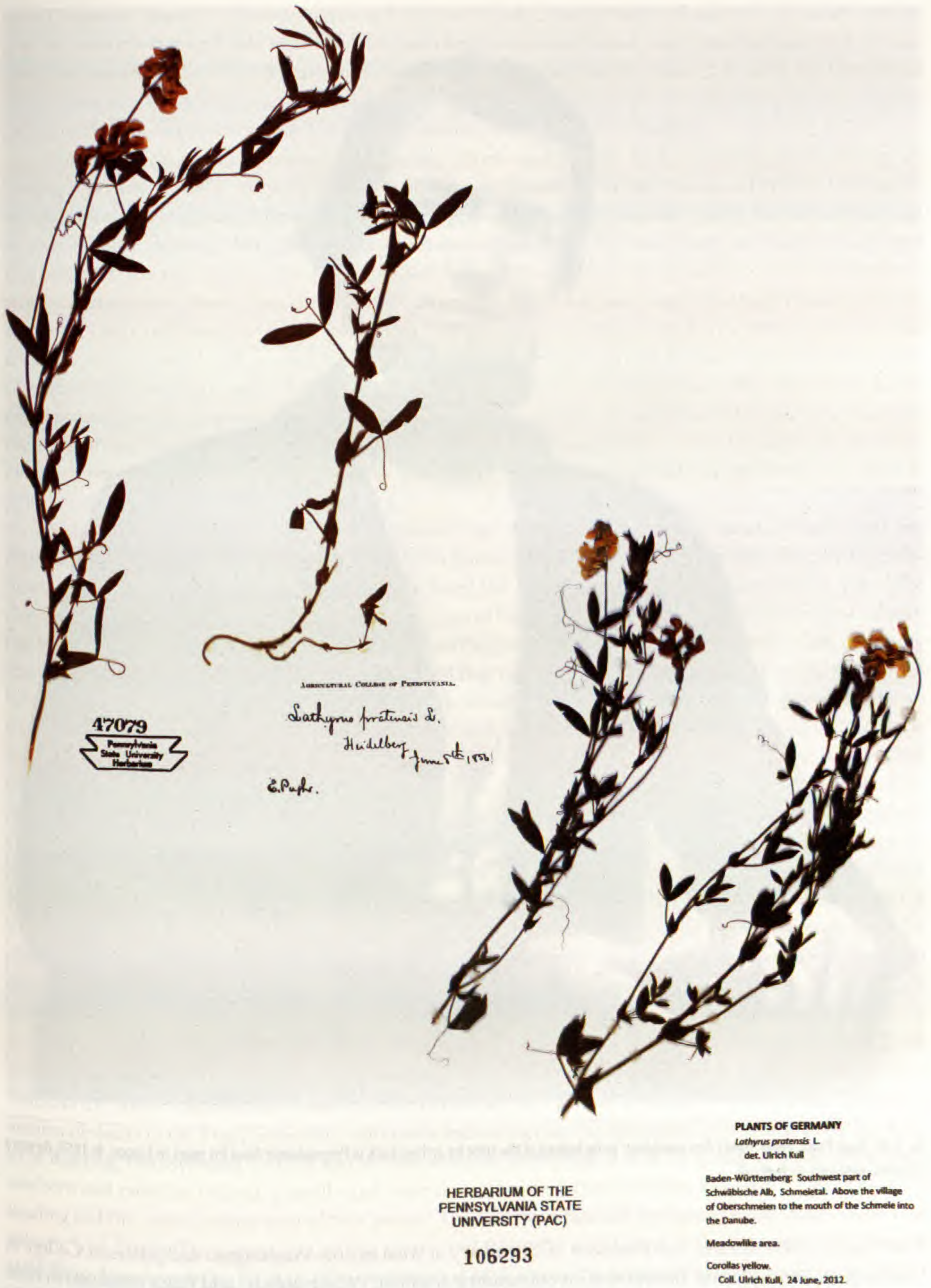
FIG. 2. One of Evan Pugh's collections from the Heidelberg area in the summer of 1856 and next to it (right), a specimen of the same species ( Lathyrus pratensis L.) collected by a German botanist, Ulrich Kull, in the same province of Germany in 2012, illustrating the durability of herbarium specimens, even over 157 years of rather challenging experiences—providing the specimens are kept dry and protected from cellulose-consuming events and animals.